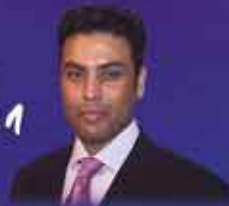
BDS (Edin.) M.CLIN.DENT. (Lond.)